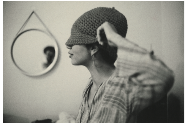
unknown June Jordan, Rome, c. 1970 gelatin silver print, 20.3 × 25.4 cm (8 × 10 in.) June Jordan Papers, Schlesinger Library, Radcliffe Institute for Advanced Study, Harvard University

ROME AND NEW YORK – From April 20 to June 11, 2023, the American Academy in Rome will present June Jordan, The Poetry of Design , the first exhibition of the work of the Harlem-born poet, designer, and activist. From the mid-1960s, when she collaborated with architect R. Buckminster Fuller on an urban plan for Harlem, to the mid-1970s, June Jordan (1936-2002) pushed the boundaries of environmental design. While Jordan’s poetry and political essays have been widely acclaimed, her contributions to architecture are only beginning to come to light. This exhibition represents a significant expansion in our understanding of Jordan’s early career and how her explorations across disciplines affected her later social justice activism. A fully illustrated catalogue has been produced in concert with the show.